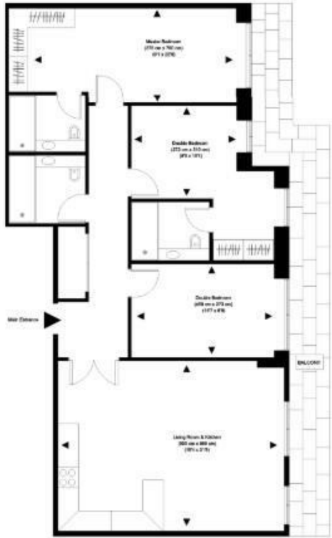
Fermont House, 15 Beaufort Square, London, NW9 Approx Internal Area : 1119 sqft - 104 sqm